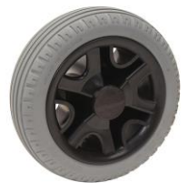
10189 Puncture-proof maturity (foamed polyurethane)